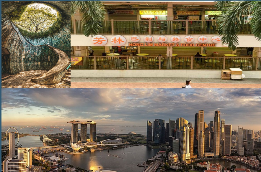
Ref: Fort Canning Park, Hong Lim Market and food centre